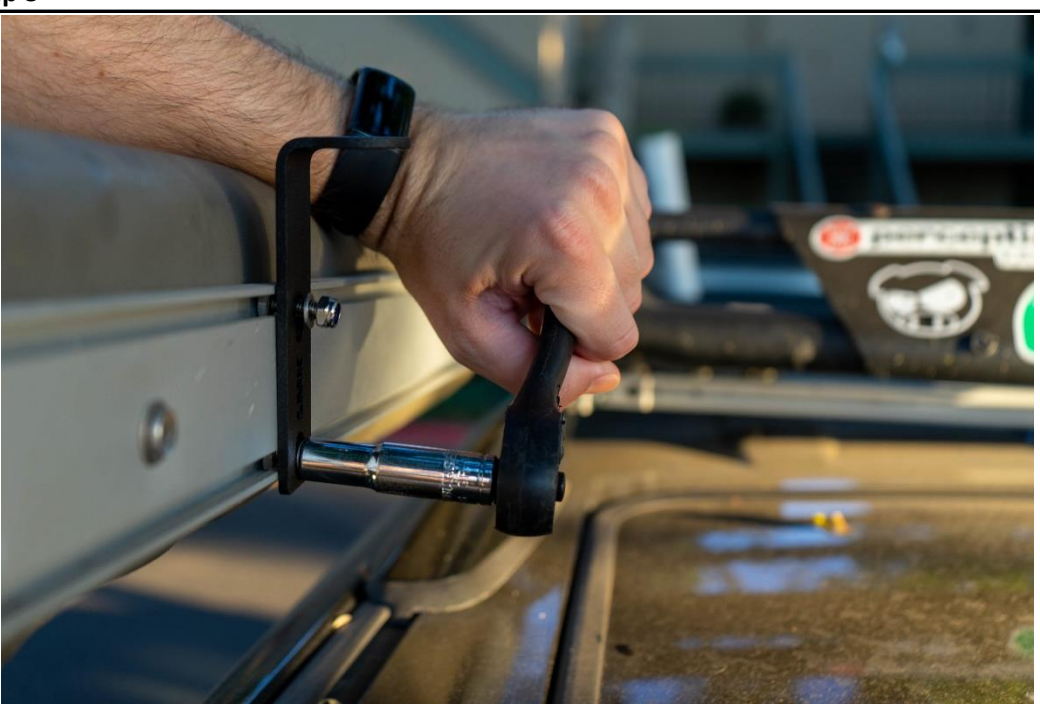
Tighten down, be sure to go just before snug, get off the vehicle and check the mount is square, once straightened out secure down. Do not over tighten!